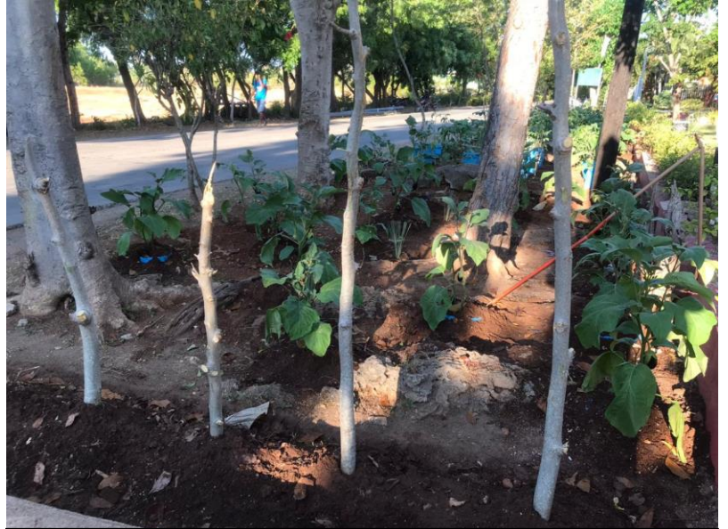
Food gardens started in the grounds of the Municipal Hall of Sta. Fe, Cebu

We also commend you for the food gardens initiative you have launched in the town of Sta Fe. This sets an excellent example that will guide your people and the rest of the province to address the chronic problem of hunger. (UN Sustainable Development Goal No. 1)