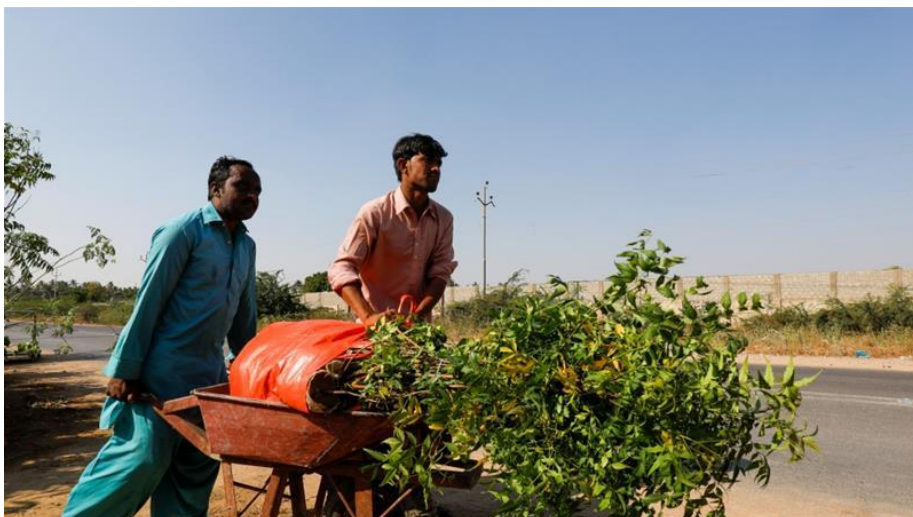
Covid-idled workers in Pakistan preparing to plant native trees in the denuded mountains.

We write to congratulate and commend your good self and your administration for the wonderful initiative to engage your people, unemployed by the covid crisis, to plant trees and restore your forests. What you are doing is an excellent example of crisis being turned around into an opportunity to achieve a greater good. Your initiative is especially important in the face of the climate emergency that will hit the face of the world and humankind after this covid crisis.